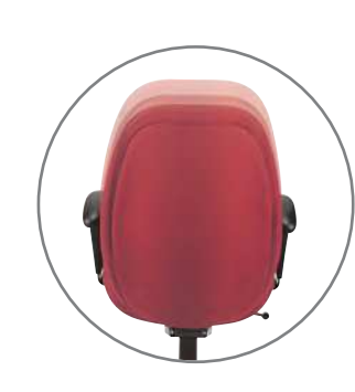
Ratchet Back Newly designed ratchet back provides a smooth 2.5" height adjustment for effortless adjustability on most models.