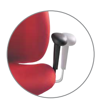
Vari-Width (WA) Arms Width adjustment is standard on all arm models. Provides 2" horizontal arm space adjustment.