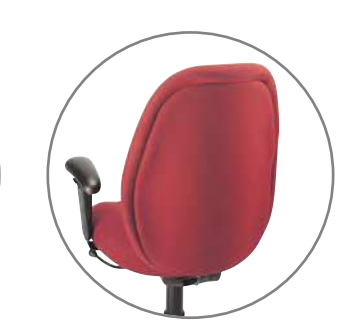
Double Radius Back European-styled, generously proportioned upholstered back with built-in lumbar support provides superior style and support.