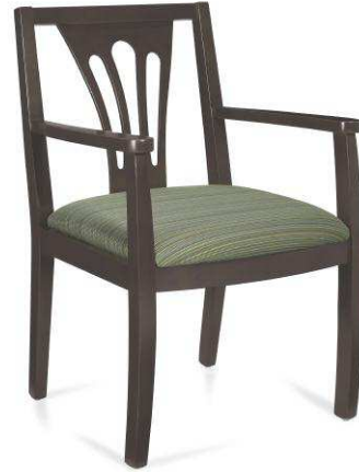
9536 Armchair with fan back

A contemporary classic design with the rich warmth of wood. Comfortable, practical and affordable. Wood guest seating with the look of prestige and elegance, that compliments almost any decor. Available with upholstered back or fan back details and in any Global wood seating finish. Curved front rail, arms and legs. Webbed seat for added comfort.