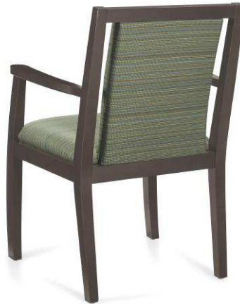
9535 Back view