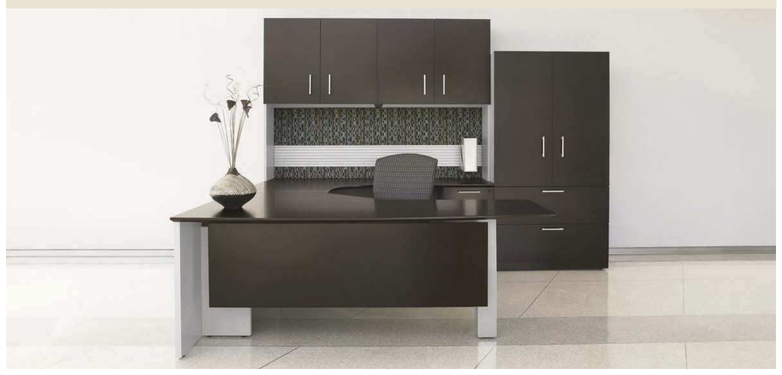
Above: Executive office "U" group configuration with boat shaped piano desk. Wood modesty panel (optional), extended curved corner credenza with pedestal, hutch, tackboard and storage cabinet. Shown in Espresso Walnut (VEW) veneer with Custom Grey (CGY) laminate chassis and Tungsten (PL66) handles.