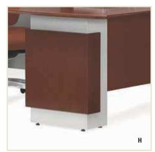
Details: A. Two inch knife edge. B. Color keyed grommets in tungsten or black. C. Coped edge on connecting worksurfaces. D. Square post leg choose Tungsten or Black (round post optional). E. Aluminum glass doors. F. Tackboard with optional accessory rail. G. Power/data grommet in anodized Aluminum or Black. H. Rectangular two tone base (optional).