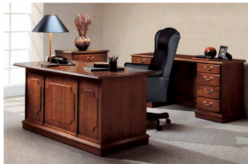
Arlington (right): Legacy Walnut (LW) finish. Seating: Breman Executive Swivel (184PB).