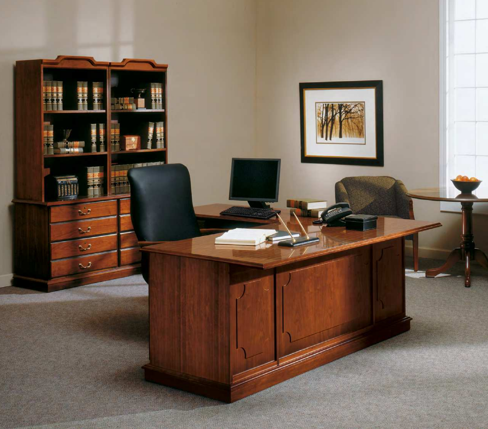
Arlington (above): Legacy Walnut (LW) finish. Seating: Larson Executive Swivel (104).