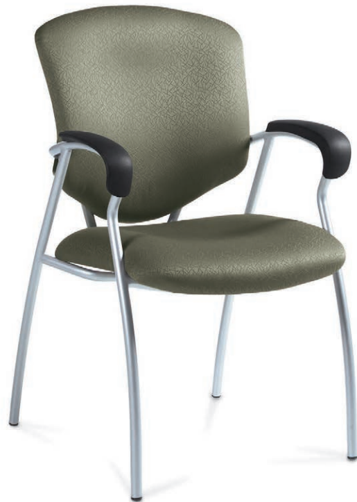
Four-legged armchair with standard Tungsten frame