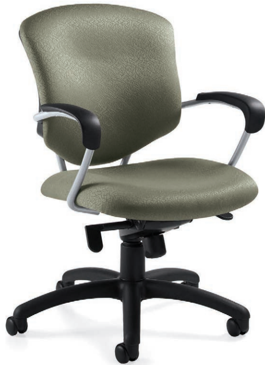
Medium back knee-tilter

Contoured cushions support the user in comfortable, contemporary style. Supra™ is available with a standard Black fiberglass reinforced nylon base or an optional Tungsten finished steel base. An armchair is available with casters for easy mobility. Value, beauty and comfort — all in one chair series. Designed by Zooney Chu.