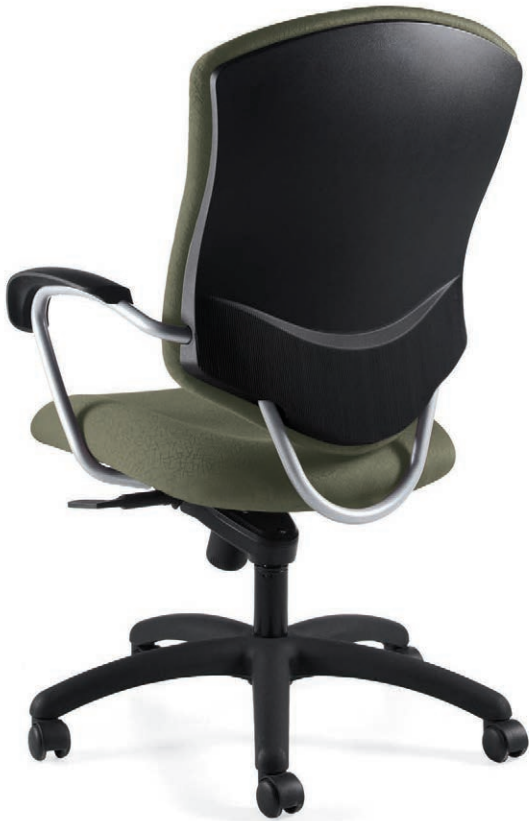
High back knee-tilter

Supra supports the user in comfortable, contemporary style.