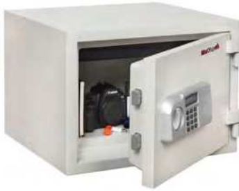
KF0915-1WHE FIREKING 1-hour fire rated