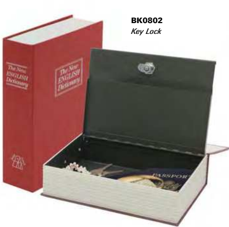
BK0802 Key Lock