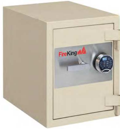
FB1612-1 Shown in Taupe with optional electronic lock