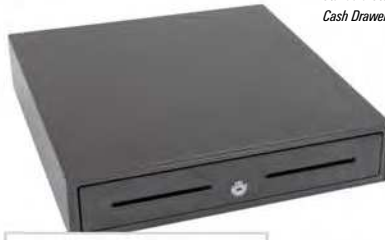
CD1317 Standard Steel Cash Drawer