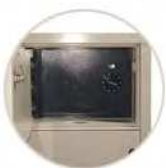
Top door conceals inner door