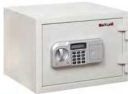
This model comes standard with one tray.