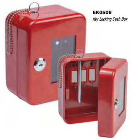
EK0506 Key Locking Cash Box