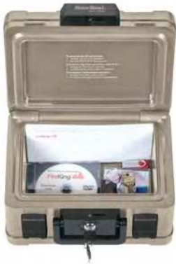
SS102 Holds #10 envelopes and folded documents