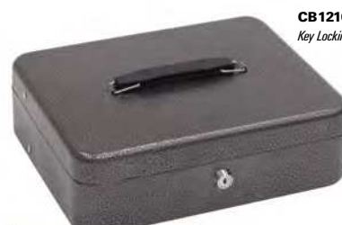
CB1210 Key Locking Cash Box