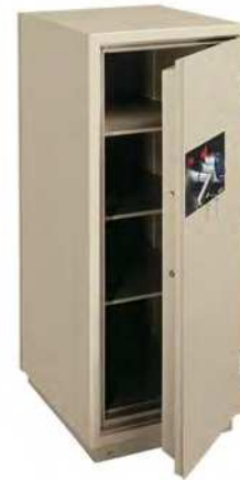
Three shelves are standard.