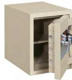
For added security, a 1/4" anchor hole comes standard in the bottom of the safe.