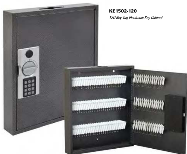
KE1502-120 120-Key Tag Electronic Key Cabinet