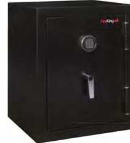
This model comes standard with two shelves.