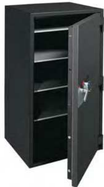
Comes standard with four shelves.