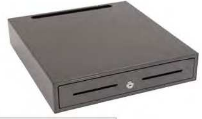
CD1618 Custom Steel Cash Drawer