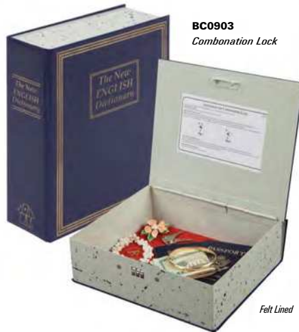
BC0903 Combination Lock