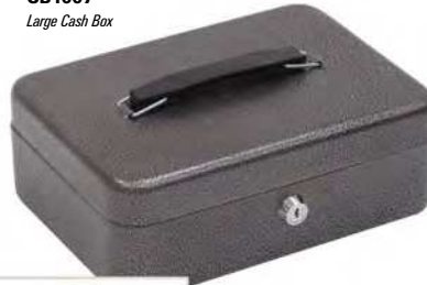
CB1007 Large Cash Box