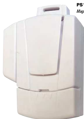
PS1033 Magnetic Door/Window Alarm