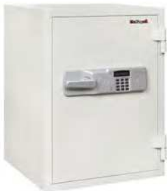
This model comes standard with one drawer and two shelves.