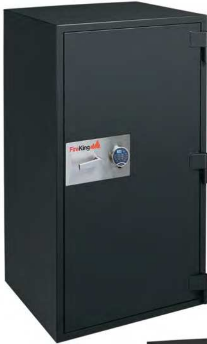
FB5428-1 Shown in Graphite with optional electronic lock