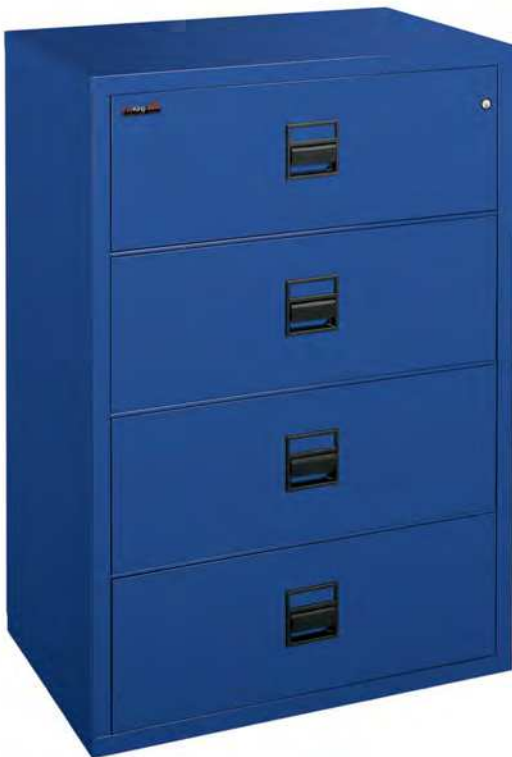
Files are available in our 11 standard colors. Special colors are available through a color match process for an additional cost.