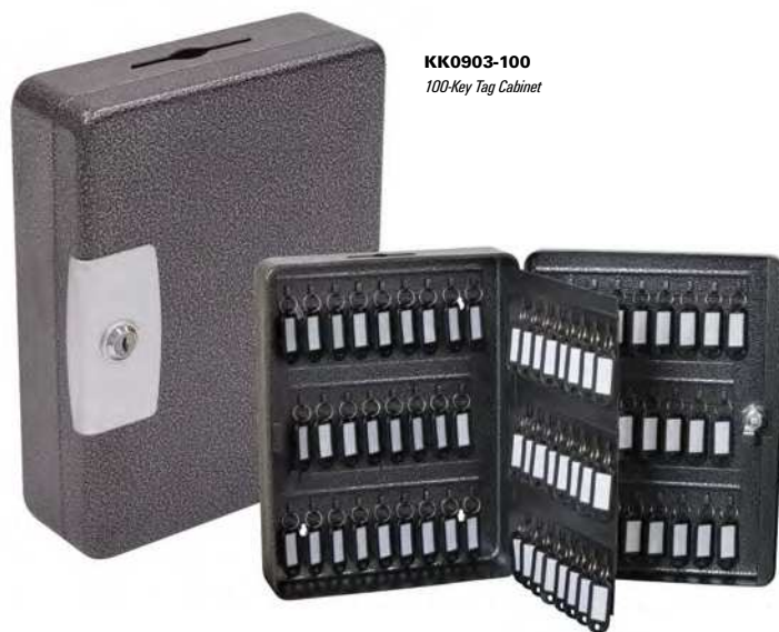
KK0903-100 100-Key Tag Cabinet