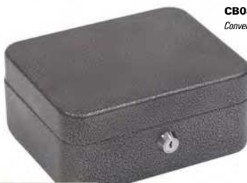
CB0806 Convertible Cash and Key Box