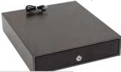
CD1314 Compact Steel Cash Drawer