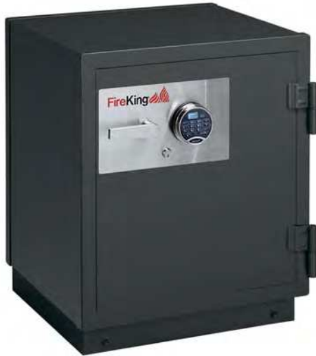
KR2115-2 Shown in Graphite with optional electronic lock