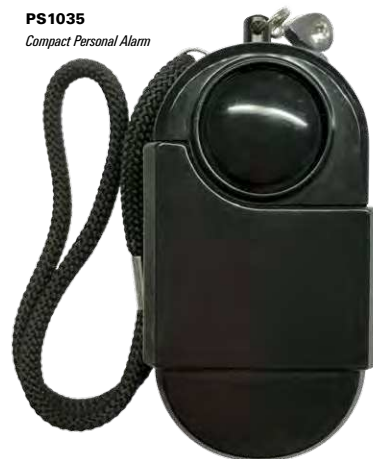
PS1035 Compact Personal Alarm