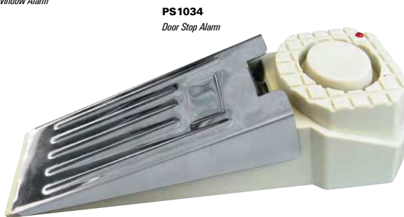
PS1034 Door Stop Alarm