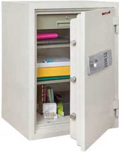
KF2617-2WHE FIREKING 2-hour fire rated