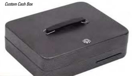
CB1209 Custom Cash Box