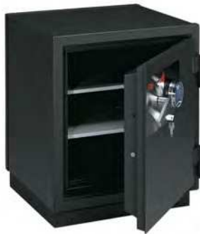
Equipped with 2 standard adjustable shelves and extra hardplate for enhanced drill resistance. All have a UL® fire and impact label, a UL® RSC burglary label and a high-security Medeco® key lock.