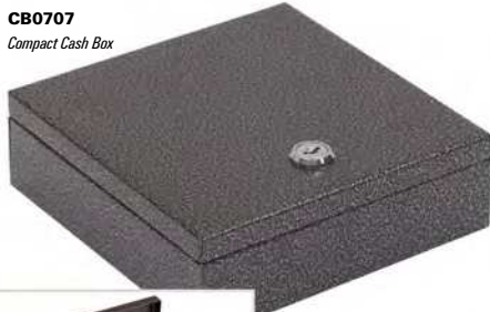
CB0707 Compact Cash Box