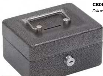
CB0604 Coin and Stamp Box