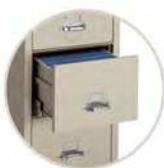
With remaining 3 file drawers